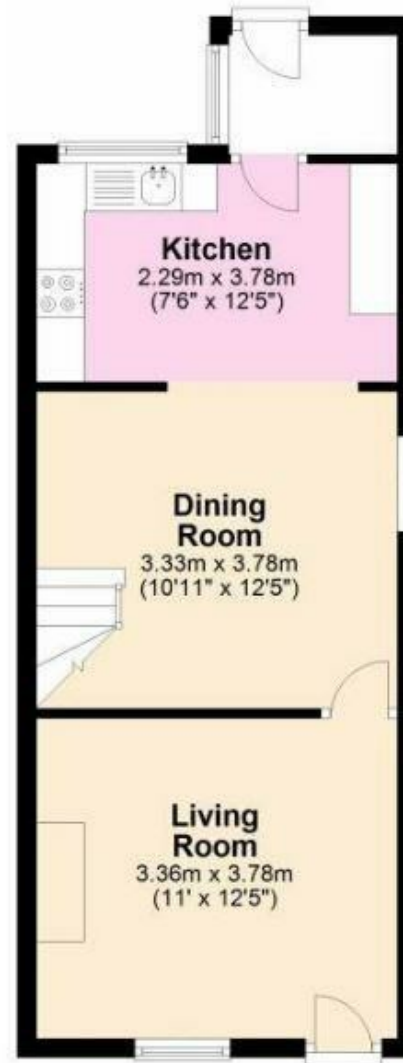
Ground Floor Approx. 37.1 sq. metres (398.9 sq. feet)